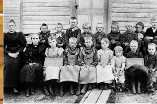
Churchville School Class of 1895, Elmhurst History Museum Collection

An engaging educational experience created by local teachers and facilitated by a history professional.