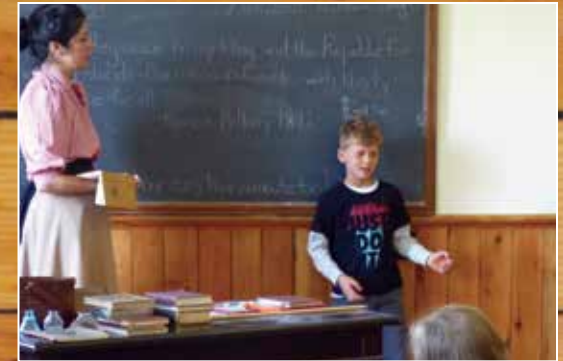
Schoolchildren are immersed in a hands-on learning experience.