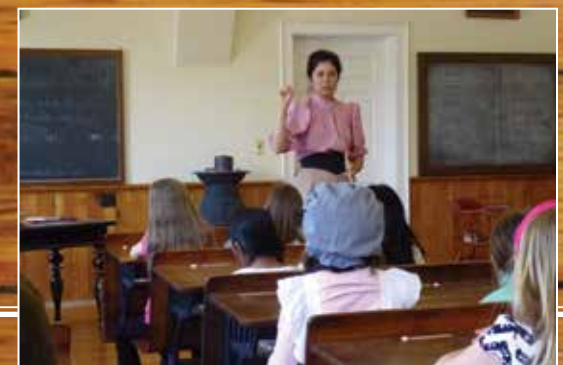
Visitors are transported to the early 1900s with an authentic schoolmarm.