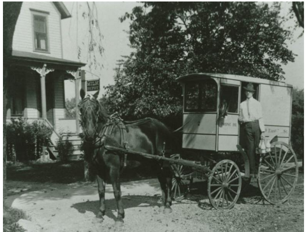
Rabe's Dairy delivery wagon, 1914, M2011.12.32